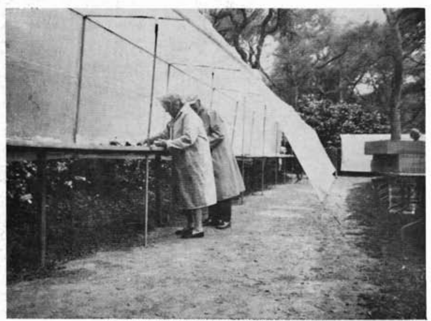
When the rain drops started the flaps were let down.